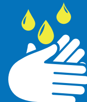
Wash or sanitise your hands as soon as possible