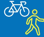
Walking and cycling