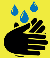
Wash or sanitise your hands before beginning your journey