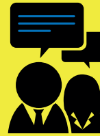
If you require assistance you should continue to request this as you normally would