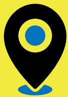
Plan ahead and use a direct route