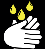
Wash or sanitise your hands as frequently as possible