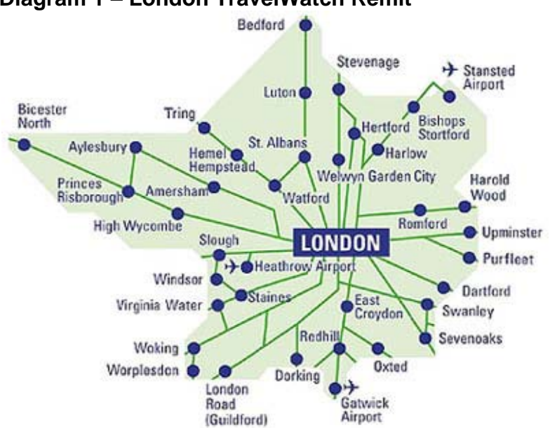
Diagram 1 – London TravelWatch Remit

London TravelWatch has written this draft consultation paper as the independent statutory watchdog representing transport users of all modes in London and rail users in its surrounding area. The map below shows London TravelWatch's areas of National Rail responsibility.