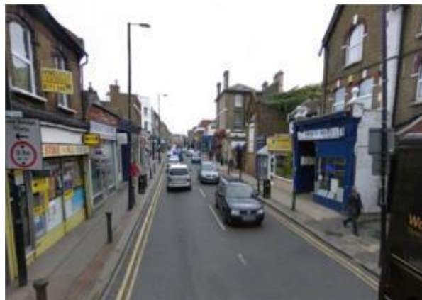
Figure 5: 'The first step is to remove items that are not fixed and can be simply lifted from the streetscape. The illegal A-boards are gone and the street is cleared of any rubbish. Even after this initial stage is possible to notice the marked improvement in space available to pedestrians.'

However, this guidance is not followed by many local highway authorities. TfL controlled streets are as cluttered as many others in London, sometimes more so.