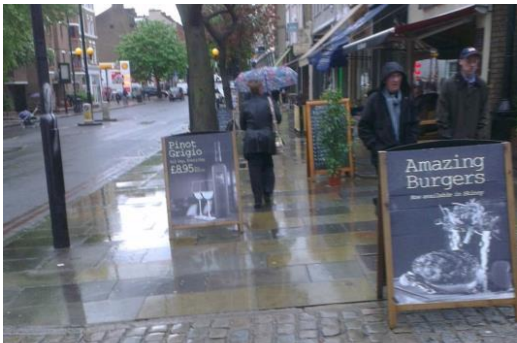
Figure 3: Upper Street, Islington. A Transport for London controlled street within the London Borough of Islington.

This report looks at these issues from a pedestrian perspective. We have investigated what the law says, what best practice is and how local authorities approach this issue and undertake the duty placed on them. Finally we conclude with what needs to be done to clear obstructions on London's pavements.