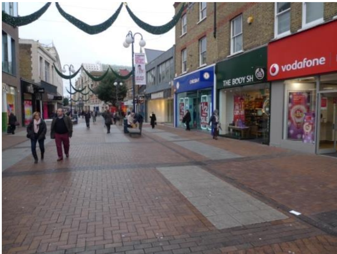
Figure 7: Kingston. Inviting and accessible.

In contrast it is pleasing that the Royal Borough of Kingston upon Thames, correctly interprets its duties regarding obstructions on the pavement. We have visited Kingston and it is apparent that the Council successfully applies its policy. The level of compliance is high. The streets of Kingston look well managed and will be inviting and accessible to all.