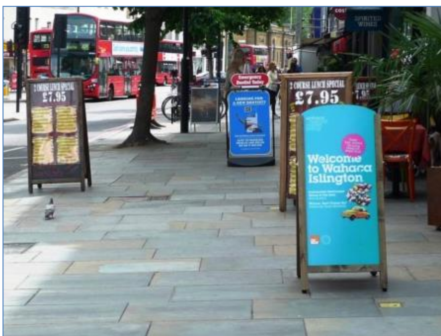
Figure 10: The A1, Upper Street. The policy allows a single A-board placed adjacent to the property wall of a much smaller size than any of these.

On many of London's streets the actual experience is generally worse than the rules, protocols or 'licenses' developed by the highway authority. It is apparent that there is much less pro-active enforcement than there should be. Boards are located against the building, next to the kerb or in the middle of the pavement. They can be larger than the authority says they permit, they narrow the pavement down to less than allowed and are more numerous than the 'rules' say they should be.