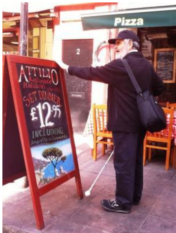
Figure 1: For visually impaired pedestrians highways obstructions are not just a nuisance.

'Blind and partially sighted pedestrians have significant problems navigating London's streets with all the legitimate street furniture there is. Additional, unlawful obstacles on the street such as advertising boards, milk trolleys, pallets and boxes just add to our difficulties. We want to see local authorities use all their powers to clear London's pavements of unlawful obstructions.'