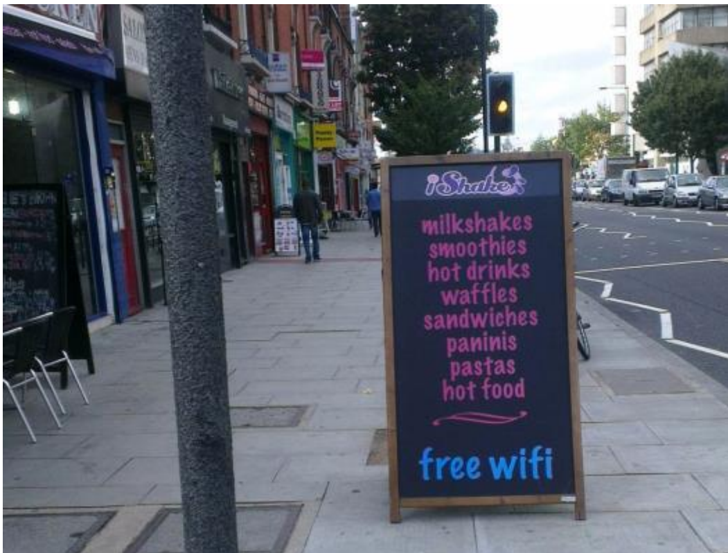
Figure 8: This board is allowed to remain deposited on the A1, Holloway Road

On all other TfL streets there is too little enforcement activity. TfL have devised rules about the location of A-boards, the size and number per frontage etc, though these are often not complied with and the level of enforcement activity means even the worst examples of very large boards deposited in the middle of the pavement do not get enforced against.