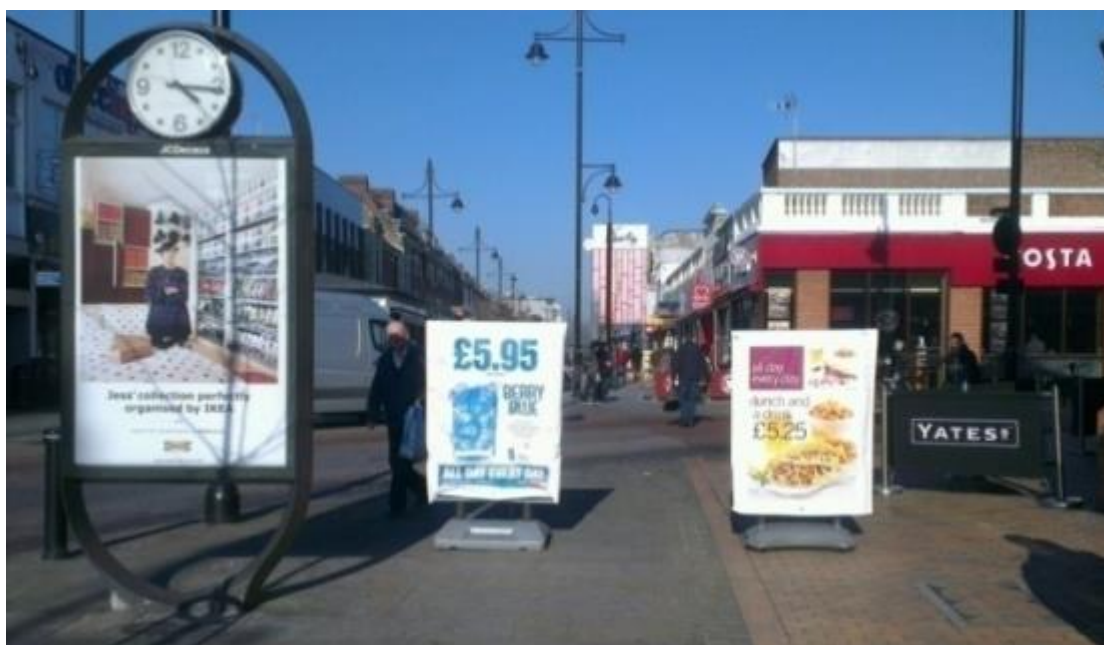
Figure 6: Romford. Uninviting and inaccessible.

Havering told us their approach is 'one of advice rather than enforcement' with the results seen below.