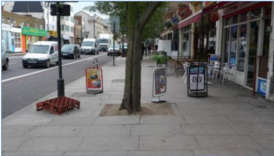
Figure 11: A too frequent site on London's streets, Holloway Road

The result is a street scene more unpleasant and less accessible than it should be. Unlawful obstruction of the pavement occurs without sanction.