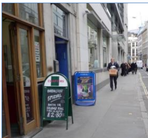
Figure 9: The City of London allow a reduction in pavement width to 1.8m. Here it is less.

The legal advice the City of London has given its street cleansing officers seems typical of the position of many authorities. The City has misinterpreted case law, that recognises the de minimis principle, to mean they can do as they please, whereas Counsel's advice to us is 'de minimis really does mean de minimis'. The City's advice means that even in the City of London, where walk trips are very high 31 and so much has been done to improve the public realm, the highway authority cleansing team deem it acceptable to allow obstructions to reduce the width of the pavement to only 1.8m. And of course that is flouted.