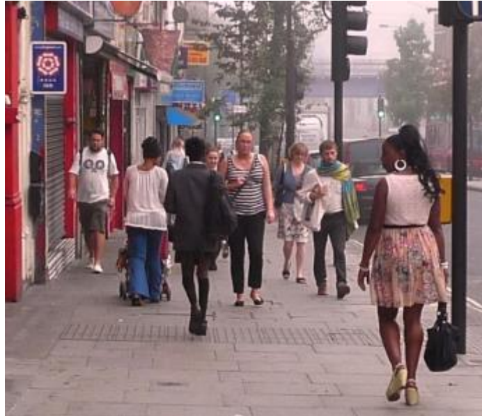
Figure 2: Managing London's streets to ensure there are no highways obstructions is a mainstream pedestrian issue.

Maintaining clear and accessible pavements is a mainstream pedestrian issue, not solely one of concern to people with disabilities. All sorts of people are inconvenienced by narrowed and obstructed pavements: pedestrians with pushchairs; visitors with suitcases; shoppers carrying awkward loads; ordinary able-bodied people in a hurry who, if they can't get through, may resort to dangerous activity like walking in the road or needlessly impeding others.