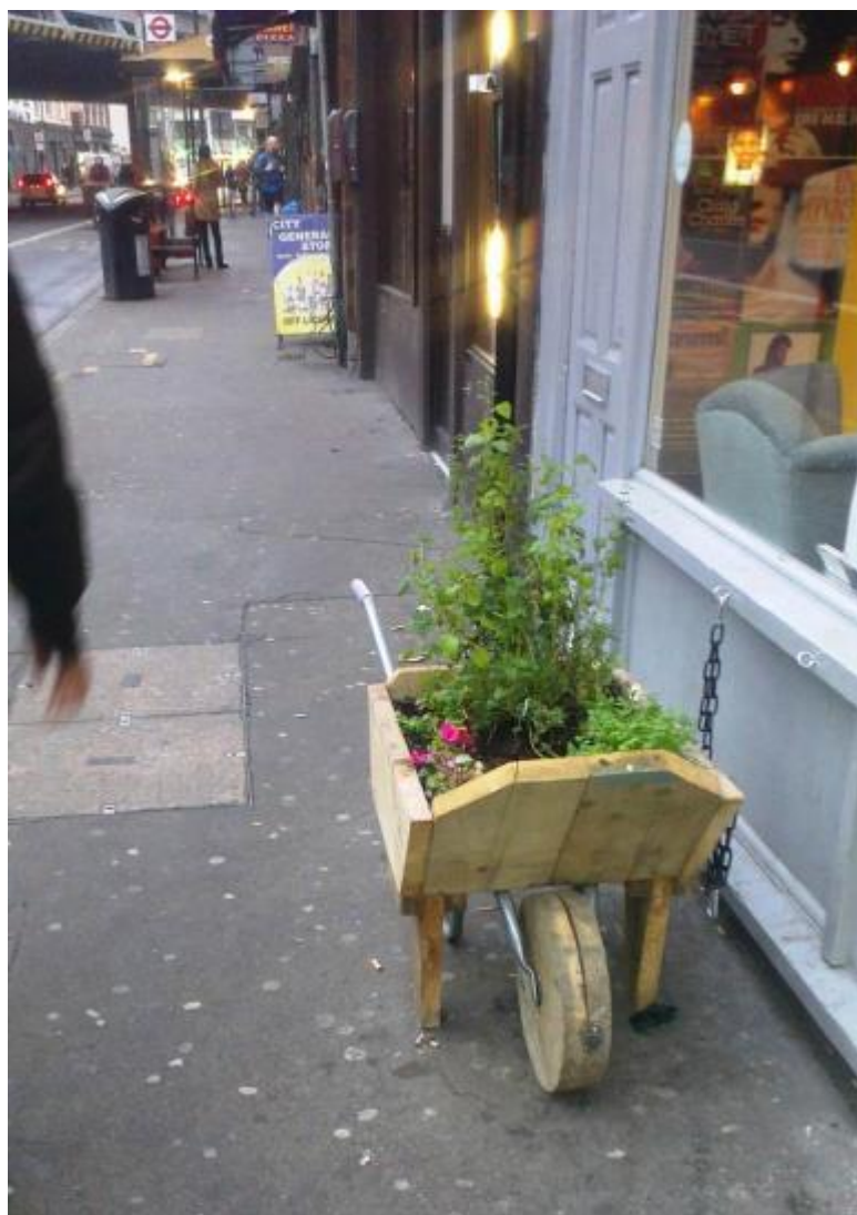
Figure 4 Whilst we have focussed in this report on advertising boards, other unlicensed obstructions such as wheelbarrows also have no place on the public highway.