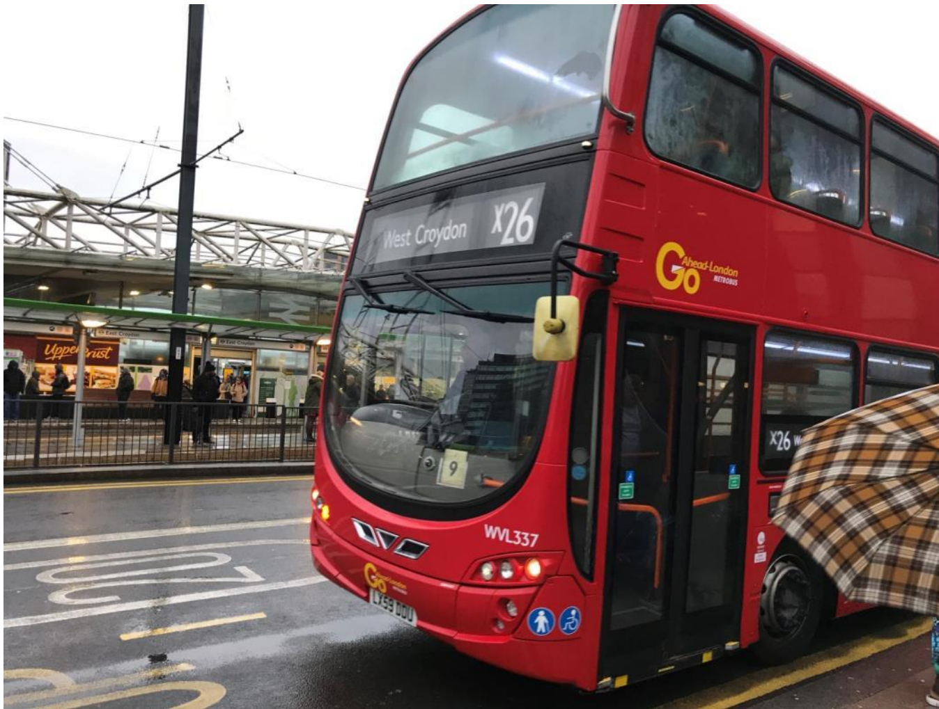
X26 bus – £1.50 from West Croydon to Heathrow