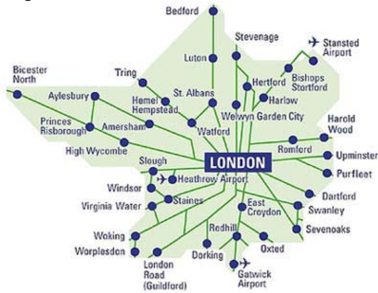
Diagram 1 – London TravelWatch Remit

This consultation draft paper sets out our how we think train services on the Chiltern route into Marylebone should be developed, both in the short term and looking ahead to the 2020s.