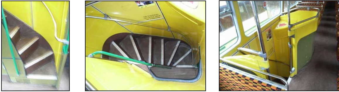
Fig 3 : Titan staircase

The Metrobus, however, was different (Fig. 4). The spiral effect was eliminated by squaring off the turns. The price for doing this was that the bottom step protruded into the gangway area of the lower saloon, reducing the width of the route from the entrance at the front to the seats at the back. In practice this was not a problem, because there were no seats opposite the staircase as this was deliberately aligned with the exit doors.