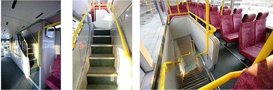
Fig 5 : Straight staircase

There was little doubt that for people who use the upper deck of a bus (i.e. those with no serious mobility impairment) a straight staircase was easy to climb and – when demonstrated on a stationary vehicle – easy to descend. However they have not been universally adopted, as many non-London operators still specify the spiral design; one reason for this is probably that the spiral occupies less space and therefore allows more seats.