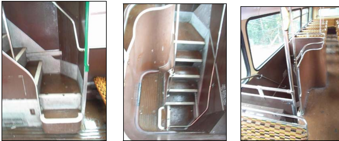
Fig 4 : Metrobus staircase

The Metrobus, however, was different (Fig. 4). The spiral effect was eliminated by squaring off the turns. The price for doing this was that the bottom step protruded into the gangway area of the lower saloon, reducing the width of the route from the entrance at the front to the seats at the back. In practice this was not a problem, because there were no seats opposite the staircase as this was deliberately aligned with the exit doors.